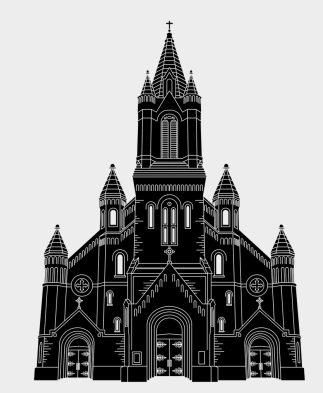
ST. LANDRY CATHOLIC CHURCH _____ Est. 1756 | Opelousas, LA _____