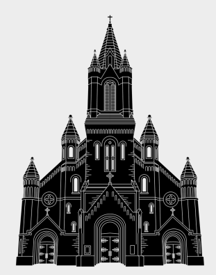
ST. LANDRY CATHOLIC CHURCH _____ Est. 1756 | Opelousas, LA _____