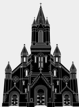
ST. LANDRY CATHOLIC CHURCH — Est. 1756 | Opelousas, LA —