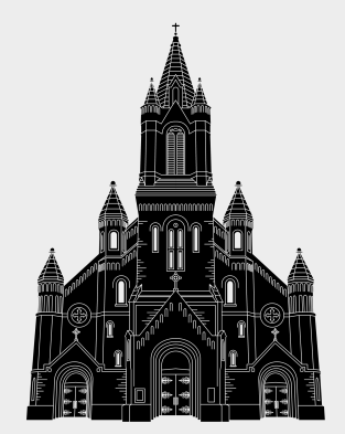
ST. LANDRY CATHOLIC CHURCH _____ Est. 1756 | Opelousas, LA _____