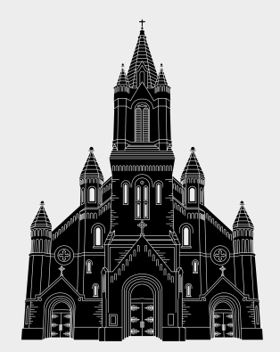
ST. LANDRY CATHOLIC CHURCH _____ Est. 1756 | Opelousas, LA _____