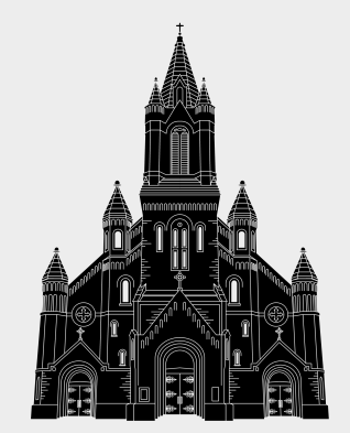
ST. LANDRY CATHOLIC CHURCH _____ Est. 1756 | Opelousas, LA _____