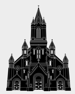
ST. LANDRY CATHOLIC CHURCH _____ Est. 1756 | Opelousas, LA _____