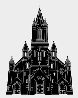
ST. LANDRY CATHOLIC CHURCH _____ Est. 1756 | Opelousas, LA _____