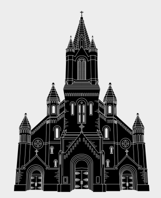
ST. LANDRY CATHOLIC CHURCH – Est. 1756 | Opelousas, LA