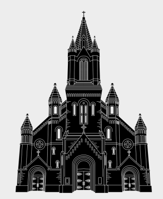
ST. LANDRY CATHOLIC CHURCH – Est. 1756 | Opelousas, LA