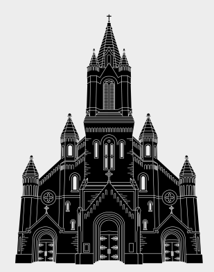
ST. LANDRY CATHOLIC CHURCH _____ Est. 1756 | Opelousas, LA _____